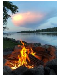
3 rd Place Lori Seviola