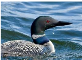
1 st Place Rebecca Eyman