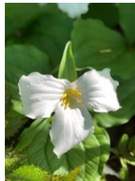
3 rd Place Marnie Mamminga