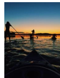
1 st Place Claire Stoelzing