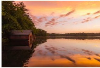
2 nd Place Dan Mersel