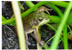
3 rd Place Rebecca Eyman