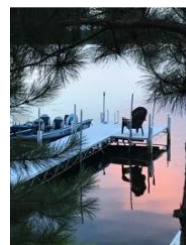
3 rd Place Mary Poldek