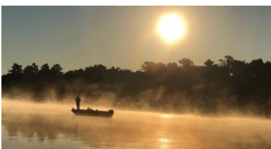
1 st Place Lori Seviola