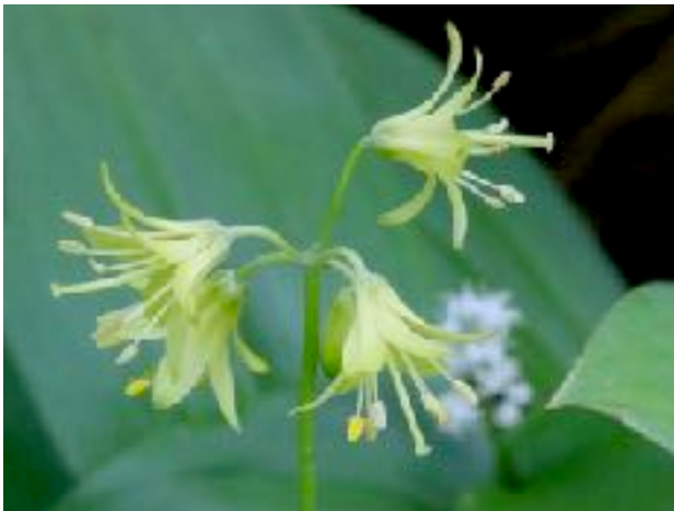
Bluebead Lily ( Clintonia borealis )

And remember, we have our annual hands-on learning opportunity for our children, too. See article on SLEEK to be held on Saturday, July 8, 2023!